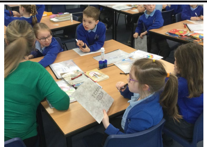
Pupils from Budbrooke Primary School

together. Suddenly, six weeks doesn't seem so long. But how much have our schools managed to pack into those six weeks? As usual, you are amazing! The new "School Bytes" feature highlights just some of what our schools have been up to from celebrating national storytelling week to rewarding student achievements.